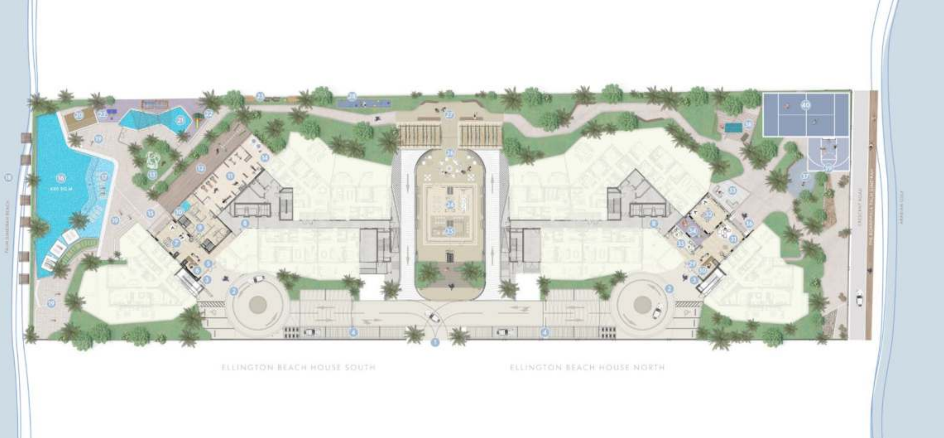
ELLINGTON BEACH HOUSE SOUTH