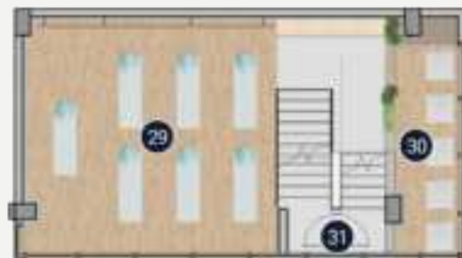
3RD FLOOR WELLNESS STUDIO